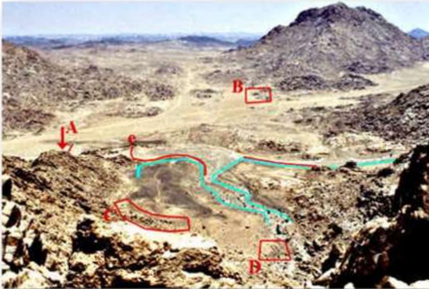
View of the "Holy Area" at the foot of Mt. Sinai